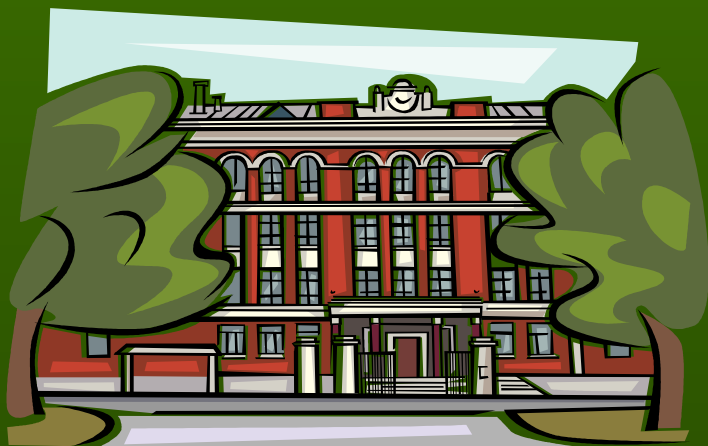
Evergreen High School Library Center