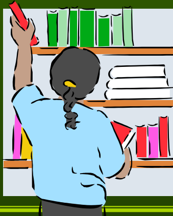
Local Public Library

• Each has its own book collection ranging from a few hundred to 80,000+ volumes, mostly old and outdated.