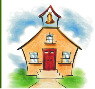
School Book Stations